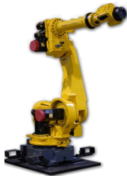
ABB Fanuc Motoman Amplifiers E-Stop Boards Axis Control Motors Cards Power Supplies Control Cards Teach Pendants